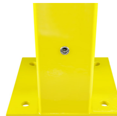
› Flush Post