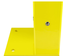
› Corner Post

Specifications subject to change without notice.